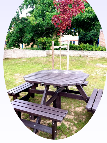
Picnic bench in memory of a much-loved student