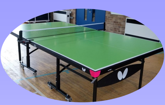
Three table tennis tables