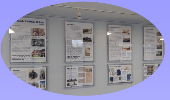
Display boards in the Hall foyer celebrating the history of the school