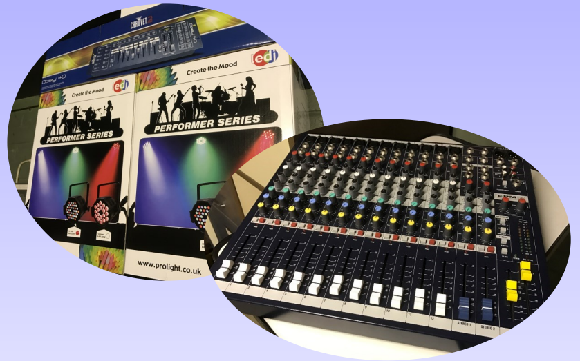
Sound and lighting equipment for performances, discos, Sports Day, school events etc